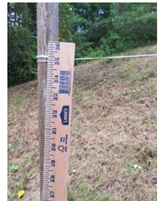
Figure 3: Measuring

Now that the string is anchored to the ground, pull the string tight between screwdriver and the stake. Use the level to make the string level. When the string is level, tie it to the stake.