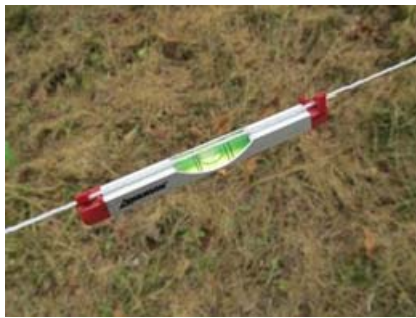
Figure 2: Leveling

Now that the string is anchored to the ground, pull the string tight between screwdriver and the stake. Use the level to make the string level. When the string is level, tie it to the stake.