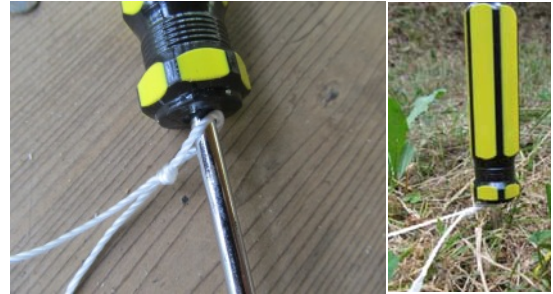
Figure 1: Set-up

Using the hammer, pound the stake firmly into the base of the slope. Make sure the stake is straight up and down. Tie the string to the shaft of the screwdriver and then push into the ground at the top of slope (Figure 1).