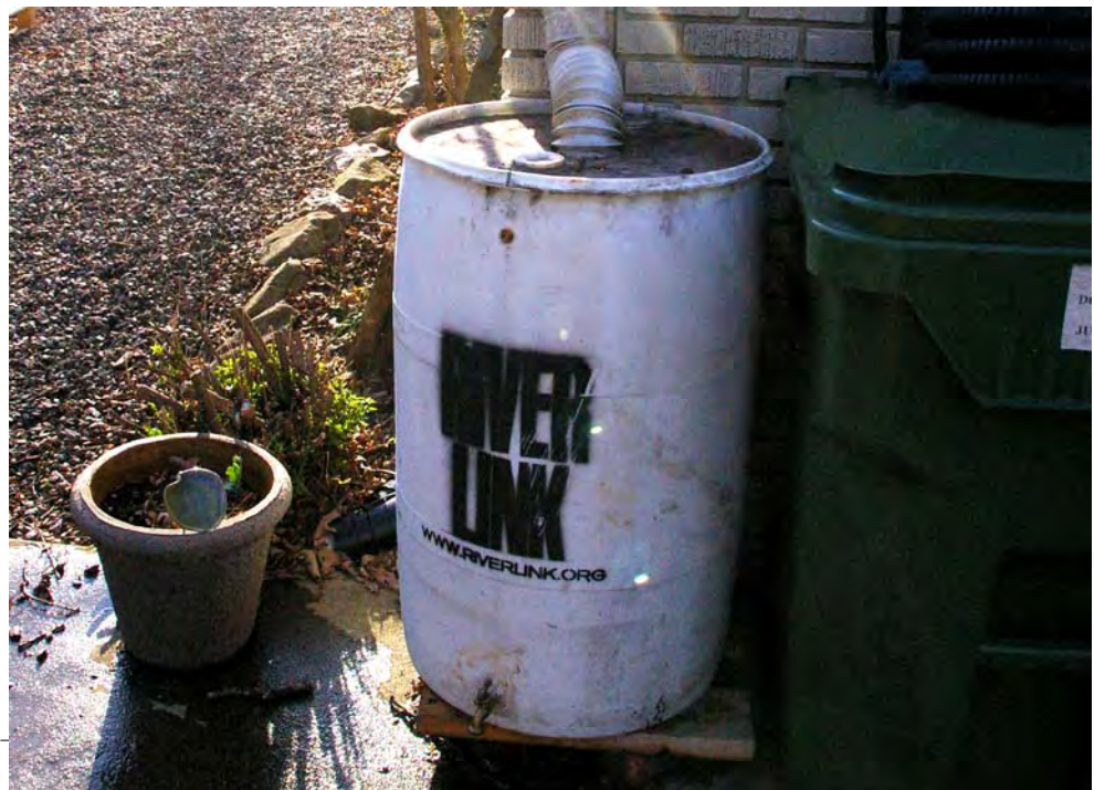
RiverLink Rain Barrel Built at April 2011 Workshop

For every 1000 square feet of collection area, you can expect to collect 600 gallons of water for every inch of rain. The roof on an average home has about 1200 square feet of collection area. In Asheville, where the annual rainfall is about 47 inches, one could potentially collect 33,840 gallons of rainwater per year!